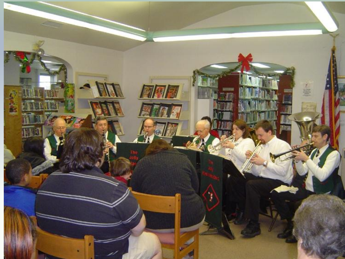
Trinity Centennial Band during “Music Fest” and a Holiday Concert in the reading room.