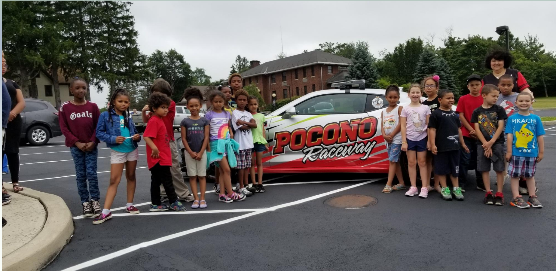
Pocono Raceway Pace Car visits for Summer Reading Program