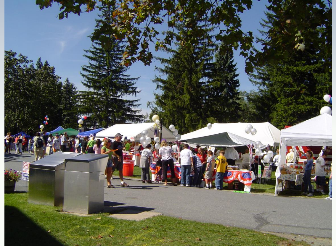
2005 Coolbaugh Celebrates!