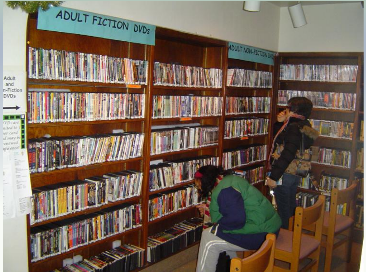
Awkward and overcrowded shelves