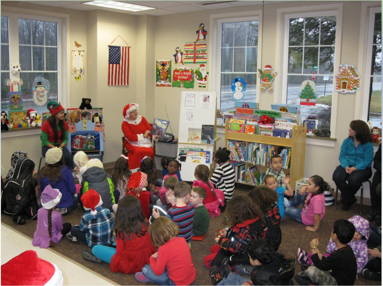
Jinglebaugh..... Holiday Fest!