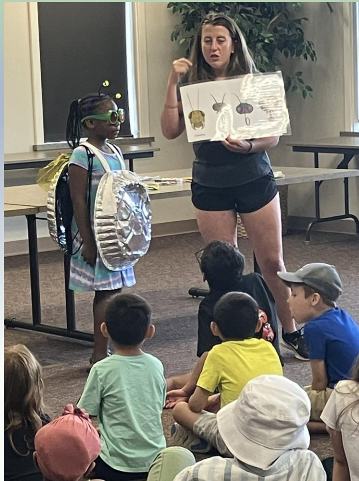
PT Reptiles Kettle Creek Environmental Ed Pocono Mountains Flying Club