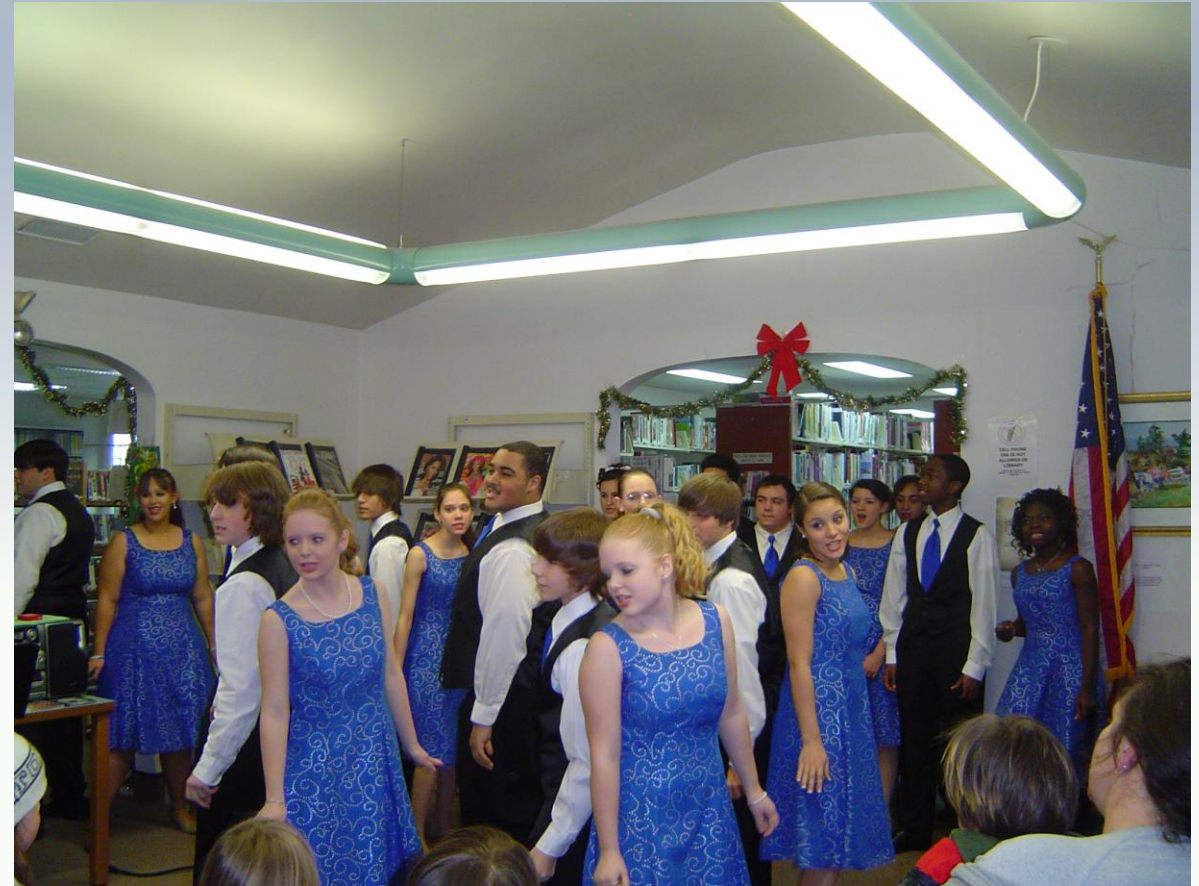
Story Time and PM West Show Choir