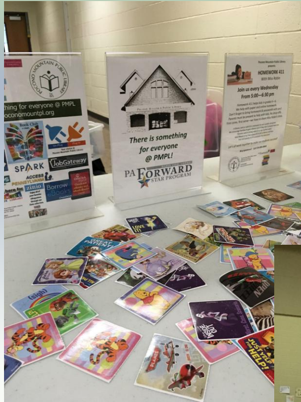
Swiftwater Elementary Center Kindergarten Sign Up Event