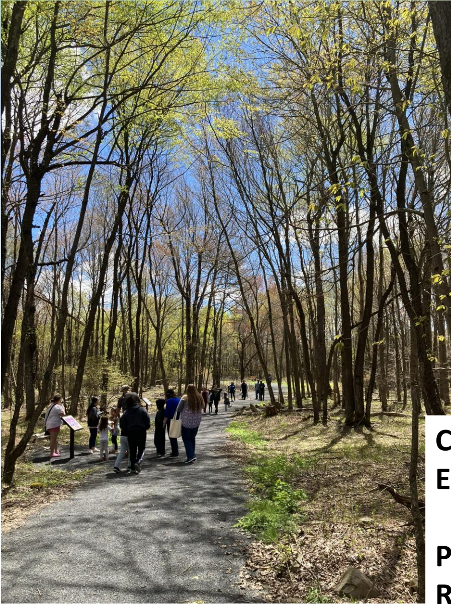
Coolbaugh Twp EAC Story Walk