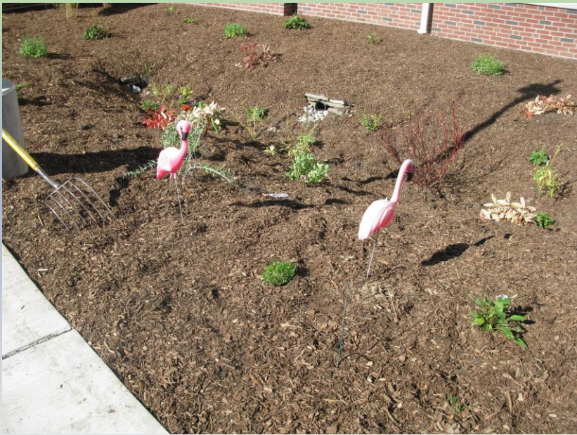
“Garden” in the stormwater retention basin in 2012.