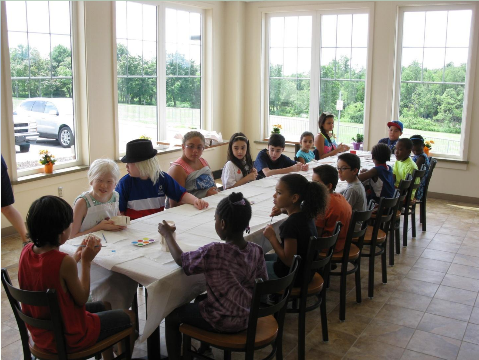
'Tween Craft Time