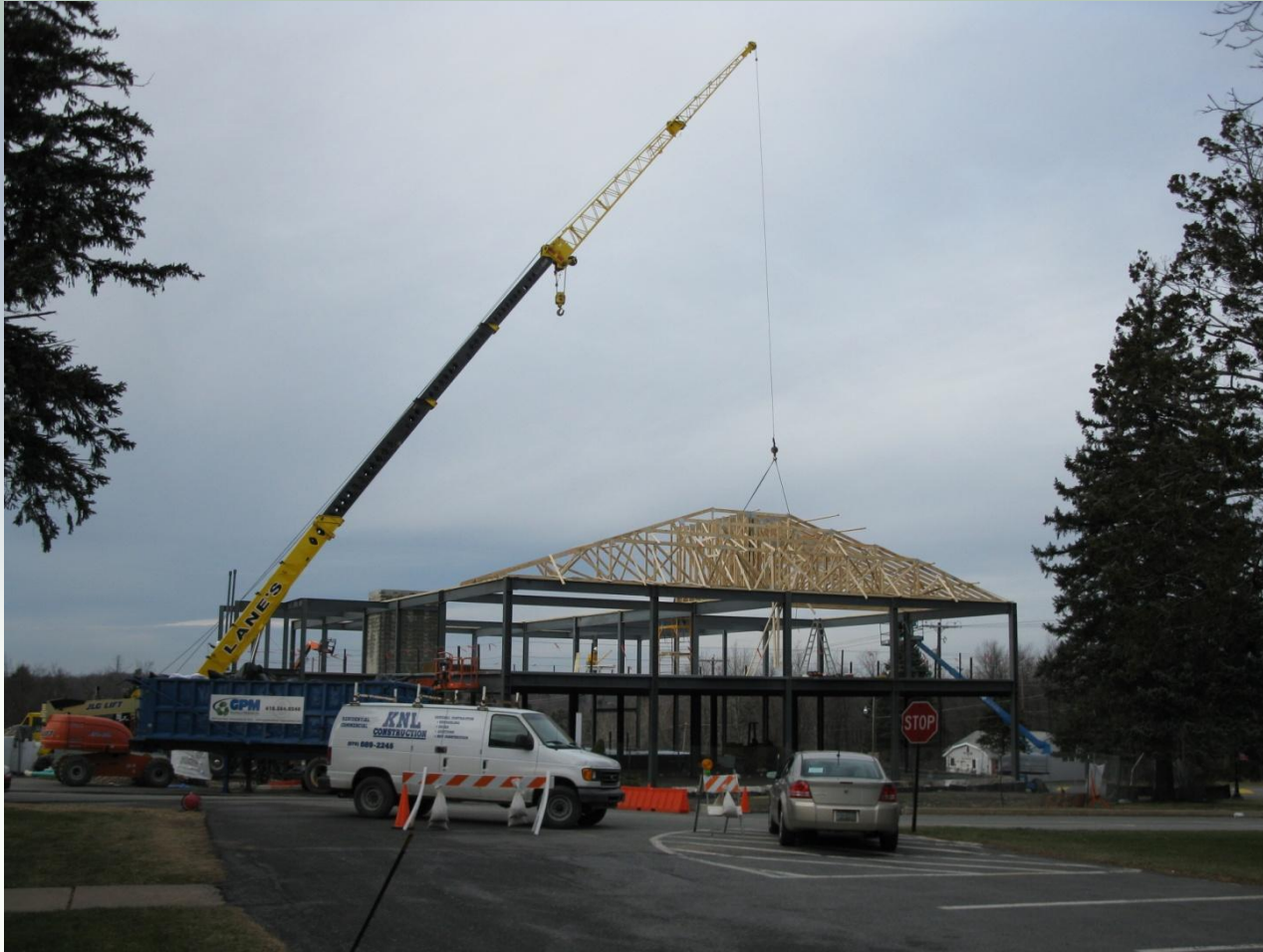
2011 Roof trusses lowered into place and work on the lines for the geothermal HVAC system.