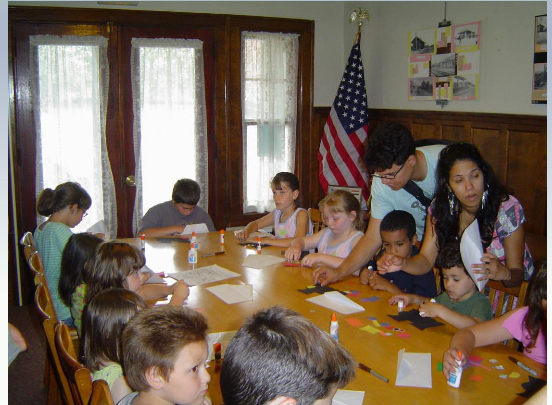
Library Field Trips to Tobyhanna State Park and Wills Mansion