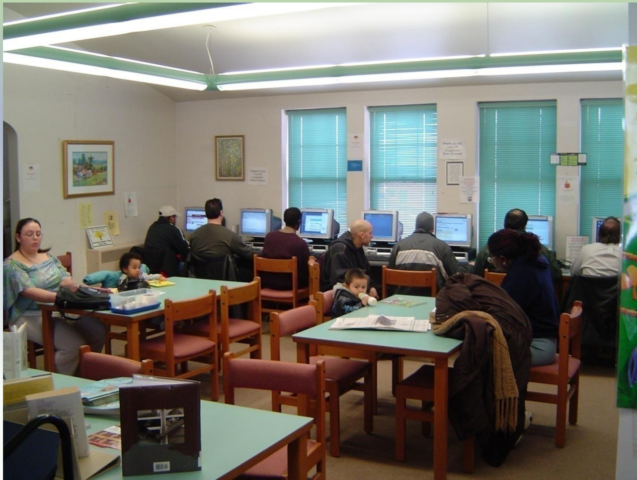
Very busy reading room and computers!