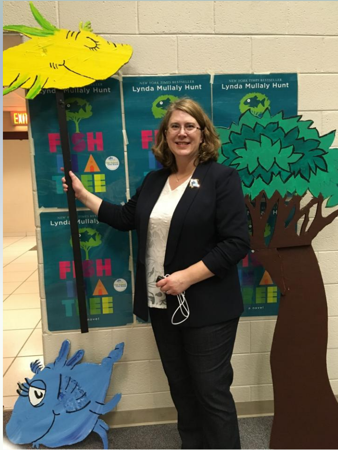
Clear Run Intermediate School One School – One Book