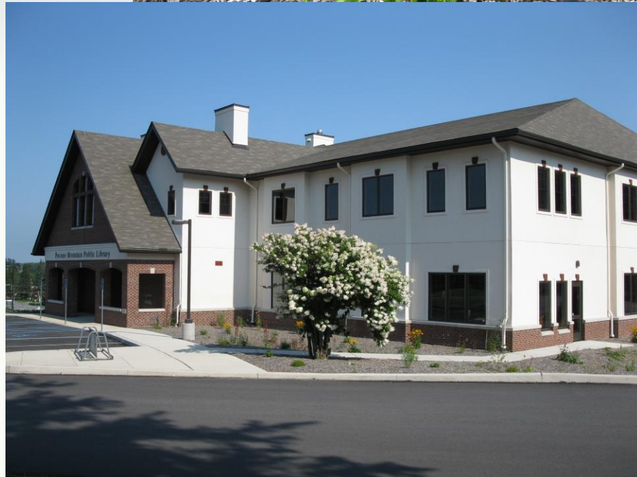
Saving the old hydrangea trees