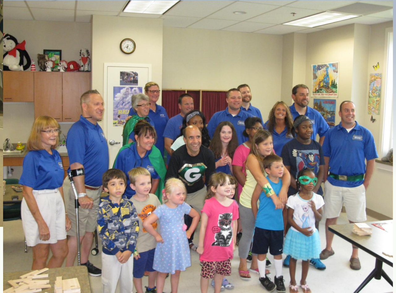
Keva Plank Challenge with PA Association of School Administrators