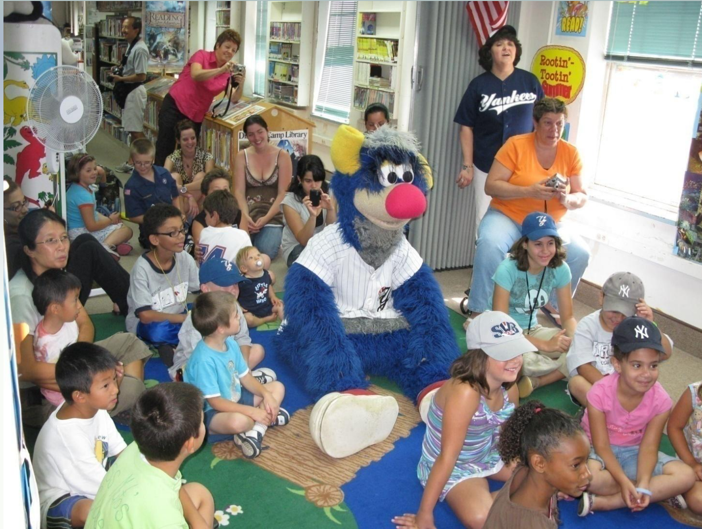
S-WB Yankees Champ the Mascot!