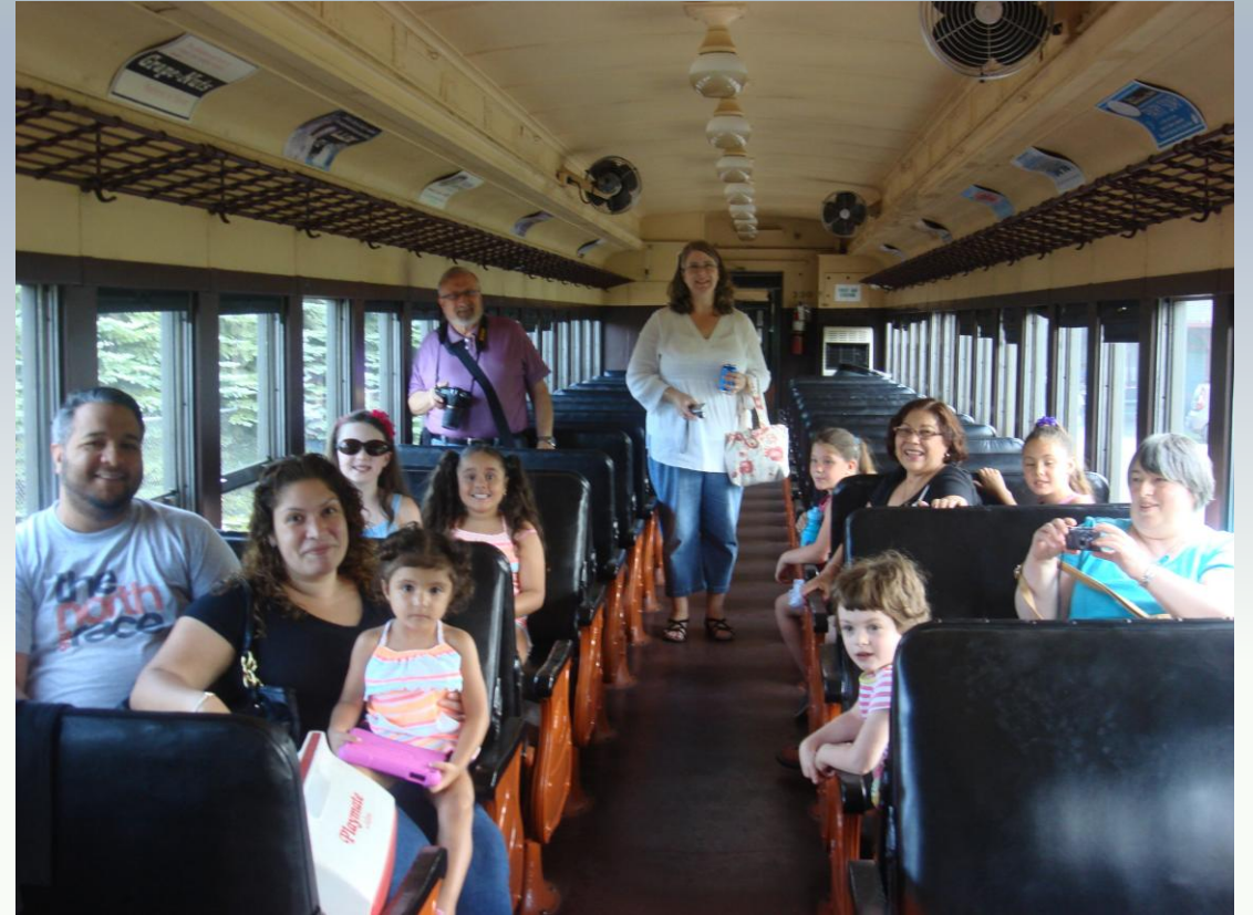
Library Summer Reading Field Trip to Tobyhanna Train Station