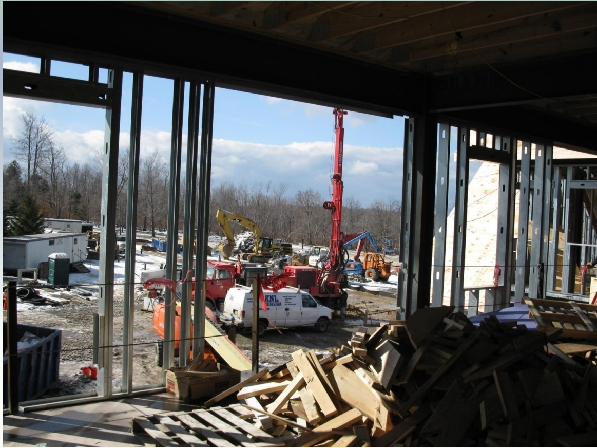
Framing work and unfinished café space.